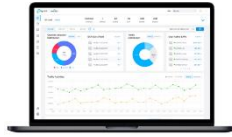
Omada Software Controller